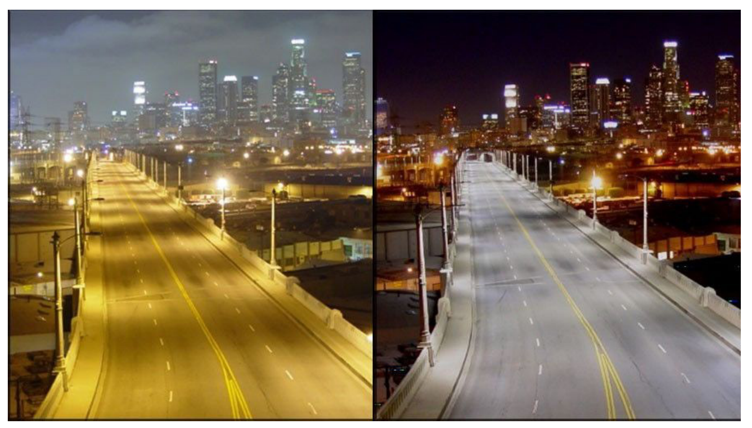
Before and after pictures of replacement lighting at the 6th Street Bridge over the Los Angeles River. The second picture shows improvements in some aspects of light pollution, as light is not directed to the sides and upwards from the upgraded fixtures, reducing skyglow. However, it also shows the use of brighter, whiter LEDs, which is not generally ideal, along with increased light bounce back from the road.